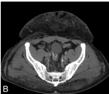
Fig 1. A , Axial CT image shows diffuse thickening and infiltration of deep soft tissues with multiple locules of fat. There is involvement of the bilateral sternocleidomastoid muscles. B , Axial CT image shows similar but less extensive involvement of the anterior abdominal wall and gluteal muscles.

Subsequent skin biopsy showed multinucleated giant cells and inflammatory infiltrates of histiocytes and lymphocytes that have a particular tropism for connective and adipose tissue, confirming the diagnosis of lipogranulomatosis due to mineral oil injection.