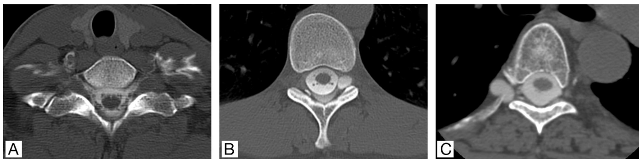
Fig 1. Postmyelography CTs showing (A) bilateral cervicothoracic CSF leaks without an associated meningeal diverticulum; B, Left thoracic meningeal diverticulum with an associated CSF leak; and C, right thoracic meningeal diverticulum without an associated CSF leak.