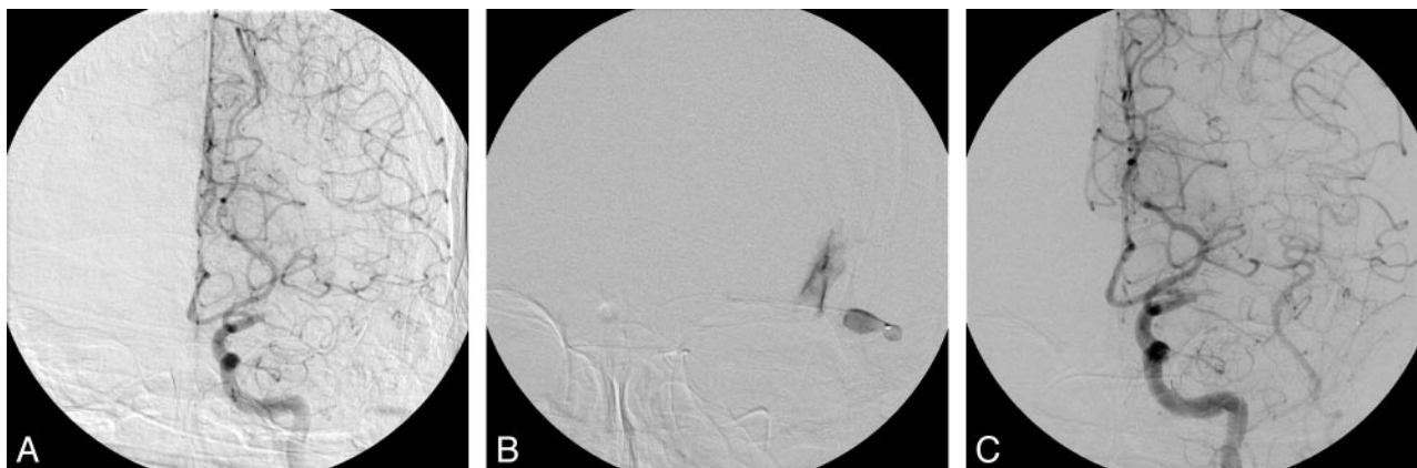
Fig 1. A–C, Anteroposterior view of the left common carotid artery with occlusion of the left M1 (A) with pial collaterals. After passing the clot, anteroposterior view of microcatheter injection (B), showing contrast extravasation in the subarachnoid space. (C) After microcatheter perforation, left internal carotid artery injection, showing absence of contrast extravasation.