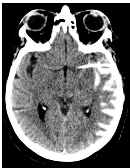
Fig 2. Immediate CT showing contrast extravasation into the subarachnoid space.