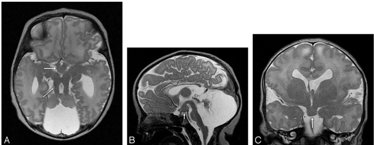
Fig 2. T2-weighted MR imaging at 2 days of age. A , Axial MR image showing hypoplasia of the vermis and both cerebellar hemispheres, the characteristic MTS ( thin arrow ) with thickened and elongated superior cerebellar peduncles, an abnormally deep interpeduncular fossa, and an HH ( thick arrow ). B , Sagittal MR image revealing significant hypoplasia of the cerebellar vermis and dysplasia of the remnants of the cerebellar vermis ( arrow ), an enlarged fourth ventricle and posterior fossa, and an HH ( white arrow ). In addition, the corpus callosum and the brain stem are hypoplastic, the pituitary stalk is thick, and the interthalamic adhesion is large. C , Coronal MR image demonstrating an HH ( arrow ), a missing left leaf of the septum pellucidum, a bulky left fornix, and a probably dysplastic cerebral cortex in the left Sylvian fissure.