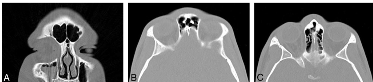
Fig 3. Coronal (A) and serial axial (B, C) noncontrast CT scans of the paranasal sinuses show 2 air cells within the intersinus septum. On the coronal image, the cells seem to arise within the septum. However, on the axial images, 1 cell is a diverticulum from the left frontal sinus (B), and the other cell is a diverticulum from the right frontal sinus (C).