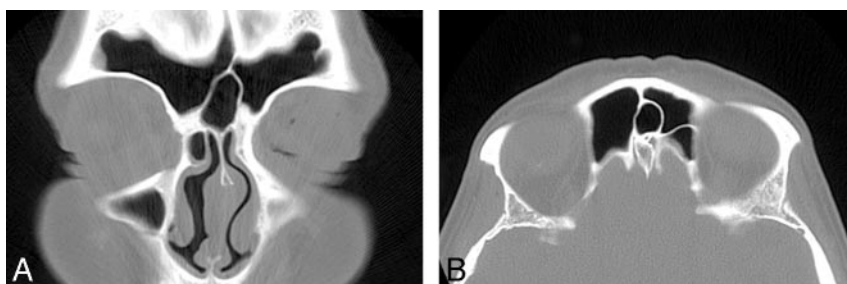
Fig 4. Coronal (A) and axial (B) noncontrast CT scans of the paranasal sinuses show an air cell within the intersinus septum. On both the coronal and axial images, no communication with either frontal sinus was seen. This is a true septal cell.

recess, which represent rudimentary anterior ethmoid cells. Each pit has the potential to form the frontal sinus; hence the variability in the outflow tract of the frontal sinus. Occasionally, the frontal sinus may develop from an ethmoid cell migrating from the ethmoid infundibulum rather than from the frontal recess, and combined patterns of development may result in multiple sinuses on each side. 7,8