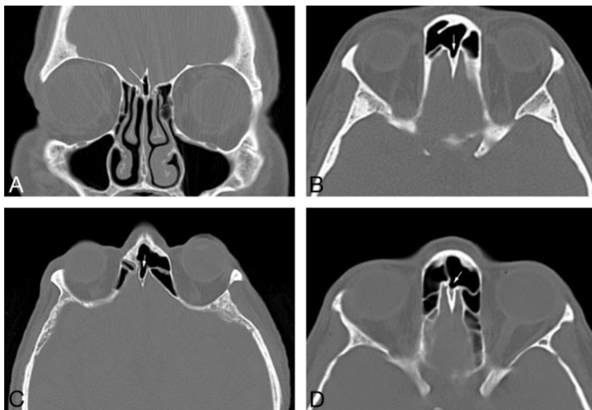
Fig 1. A, Coronal CT scan of the paranasal sinuses in a 45-year-old woman with difficulty breathing shows the typical appearance of crista galli pneumatization (arrow). B, Axial CT scan of the paranasal sinuses in a 51-year-old man with sinus pain shows extensive pneumatization of the crista galli from the right frontal sinus (arrow). C, Axial CT scan of the paranasal sinuses in a 63-year-old man with difficulty breathing shows extensive pneumatization of the crista galli from the left frontal sinus (arrow). D, Axial CT scan of the paranasal sinuses in a 33-year-old woman with difficulty breathing shows minimal pneumatization of the anterior crista galli from the left frontal sinus (arrow).