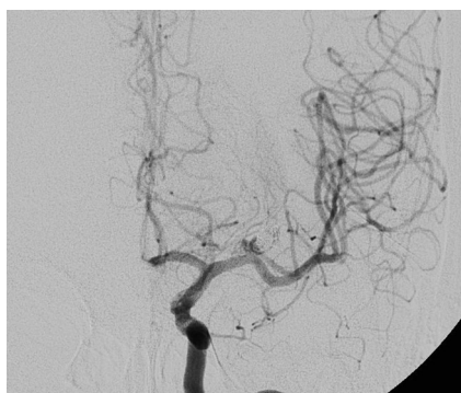
Fig 3. Conventional angiography shows subtotal occlusion of the aneurysm with a small stable neck remnant.

a reduction or resolution of the brain edema in others. 12 The mechanism by which edema develops around an aneurysm is unclear, and various interrelated factors have been postulated. These include intraluminal thrombosis, aneurysm pulsatility, intramural hemorrhage, wall inflammation, and cytokine release. 2,12 Some patients respond to steroid therapy, a feature that supports an inflammatory etiology, as does the observation of increased white cells and protein in the CSF of certain patients 4 ; however, complete symptomatic improvement is not always guaranteed. 3,4,9,13