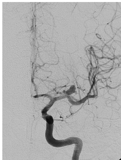
Fig 1. Conventional angiography shows a 7-mm aneurysm arising from the proximal bifurcation of the left MCA.

Twenty days after treatment, the patient presented to her general practitioner following 2 nocturnal seizures (tonic-clonic) and further daytime complex partial seizures. After the administration of carbamazepine, the events ceased and the patient did not seek a neurologic consultation for a further 8 weeks. MR imaging at this time (approximately 3 months after embolization) showed new ill-defined increased T2 signal intensity surrounding the aneurysm with contiguous extension into the external capsule and temporal strut, but no hydrocephalus (Fig 2A–C). Steroids were not prescribed because the patient was symptom-free on anticonvulsant therapy. A check diag-