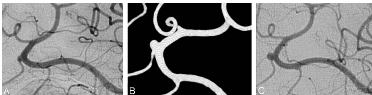
Fig 3. A 25-year-old woman with multiple additional untreated aneurysms. A , Initial lateral view of an internal carotid angiogram shows a 1.5-mm pericallosal artery aneurysm. B , Five-year follow-up MRA reveals growth to 2.5 mm. C , Angiogram confirms MRA findings.