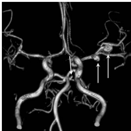
Fig 5. Five-year MRA follow-up in a 42-year-old woman with a coiled right middle cerebral artery aneurysm demonstrates 2 left middle cerebral artery aneurysms and a superior cerebellar artery aneurysm (arrows) without available previous imaging. The 2 middle cerebral artery aneurysms were clipped.