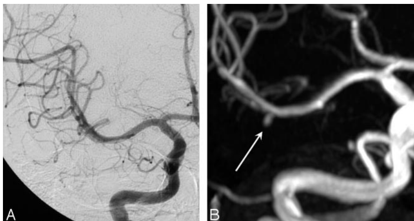
Fig 4. A 56-year-old woman with a de novo 3-mm middle cerebral artery aneurysm. A , Initial angiogram of the middle cerebral artery. B , MRA after 5 years shows 3-mm de novo aneurysm (arrow).

patients had 1 additional aneurysm, 2 patients had 2, and 3 patients had \geq 3 additional aneurysms.