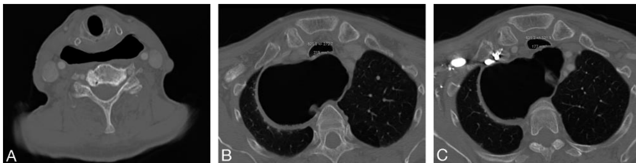
Fig 2. Axial CT image (A) just below the level of the cricopharyngeus muscle shows dilation of the upper esophagus without evidence of tracheal compression. Axial CT images at the level of the thoracic inlet obtained in the expiration (B) and inspiration (C) demonstrate narrowing of the trachea from a cross-sectional area of 219 mm 2 on expiration to 177 mm 2 on inspiration. Cross-sectional areas were calculated by use of the Vitrea 2 software.