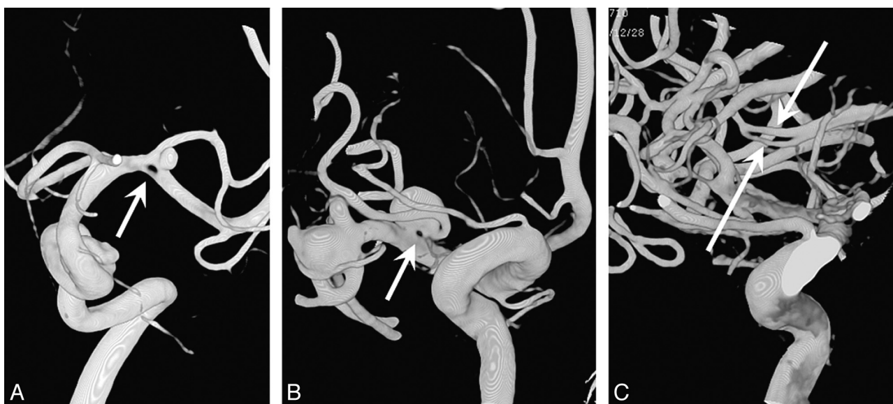
Fig 4. Examples of middle cerebral artery fenestrations (arrows). A , Fenestration at the bifurcation with an associated aneurysm. B , Small fenestration at the neck of an aneurysm in a patient with 2 middle cerebral artery aneurysms. C , A 10-mm segment fenestration in a distal middle cerebral artery (M3).

The anatomic relationship of the 56 fenestrations and the aneurysms in 54 patients with aneurysms was as follows: aneurysm located on the fenestration itself in 10 (18%), aneurysm adjacent to the fenestration in 12 (21%), and aneurysm remote from the fenestration in 34 (68%). In 208 patients with 218 aneurysms, 10 aneurysms (4.5%) were located on a fenestration and 210 were not. Of 61 fenestrations, 51 (84%) were not associated with an aneurysm.