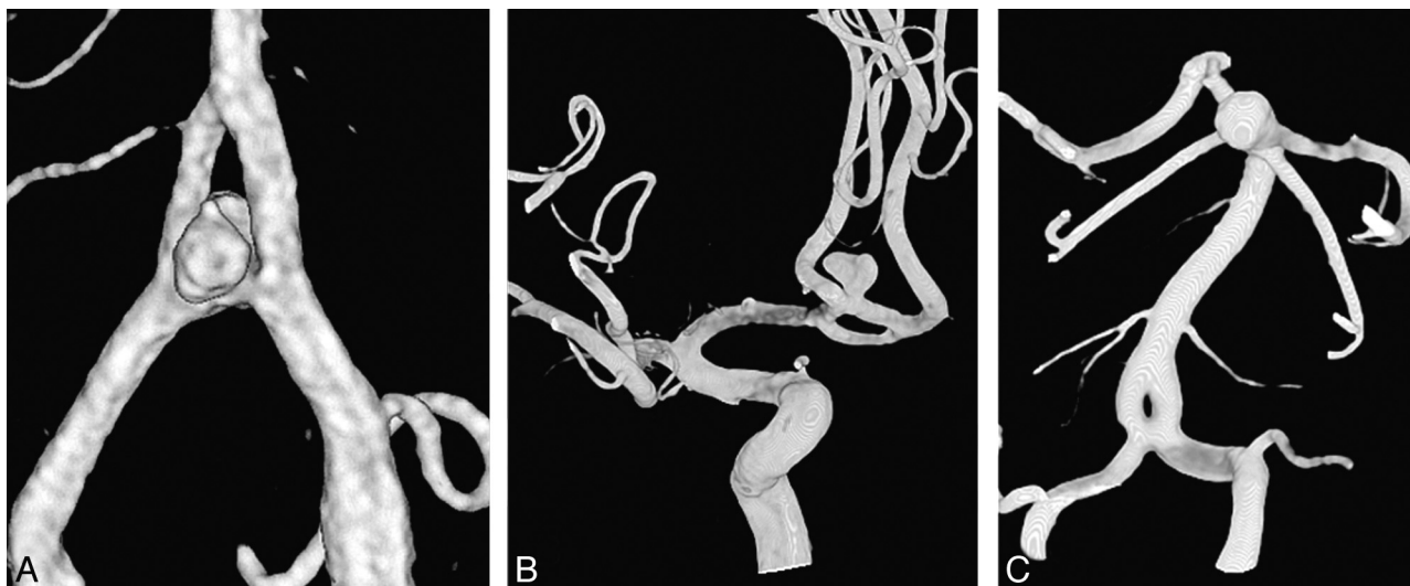
Fig 1. Classification of the relation of the location of the fenestration with the location of the aneurysm. A , Aneurysm is located on the fenestration in a patient with a vertebrobasilar junction aneurysm and a proximal basilar fenestration. B , Aneurysm is located adjacent to (but not on) a fenestration in a patient with an AcomA aneurysm and a fenestration of the AcomA. C , Aneurysm is located remote from a fenestration in a patient with a basilar tip aneurysm and a proximal basilar fenestration.

In patients with both aneurysms and fenestrations, we classified the relation of the location of the fenestration with the location of the aneurysms as remote from the fenestration, adjacent but unrelated to the fenestration, or on the fenestration itself (Fig 1). In addition, we assessed whether detected fenestrations were visible in retrospect on standard projections of 2D angiographic images.