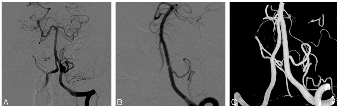
Fig 1. Images in a 42-year-old man presenting with an acute SAH. A , Left vertebral artery angiogram reveals a dissecting aneurysm with an asymmetrically fusiform appearance at the segment-bearing left posterior inferior cerebellar artery. At 42 months after treatment with double overlapping stents, a left vertebral angiogram ( B ) and 3D reconstruction images ( C ) show complete obliteration of the dissecting aneurysm sac with preservation of the left PICA.