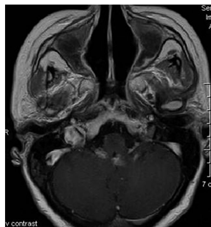
Fig 2. Control MR imaging examination, which was performed after 20 days of treatment, demonstrates regression in both nodular-enhancing lesions (the largest was 10 mm in diameter) in an axial T1-weighted contrast-enhanced sequence.