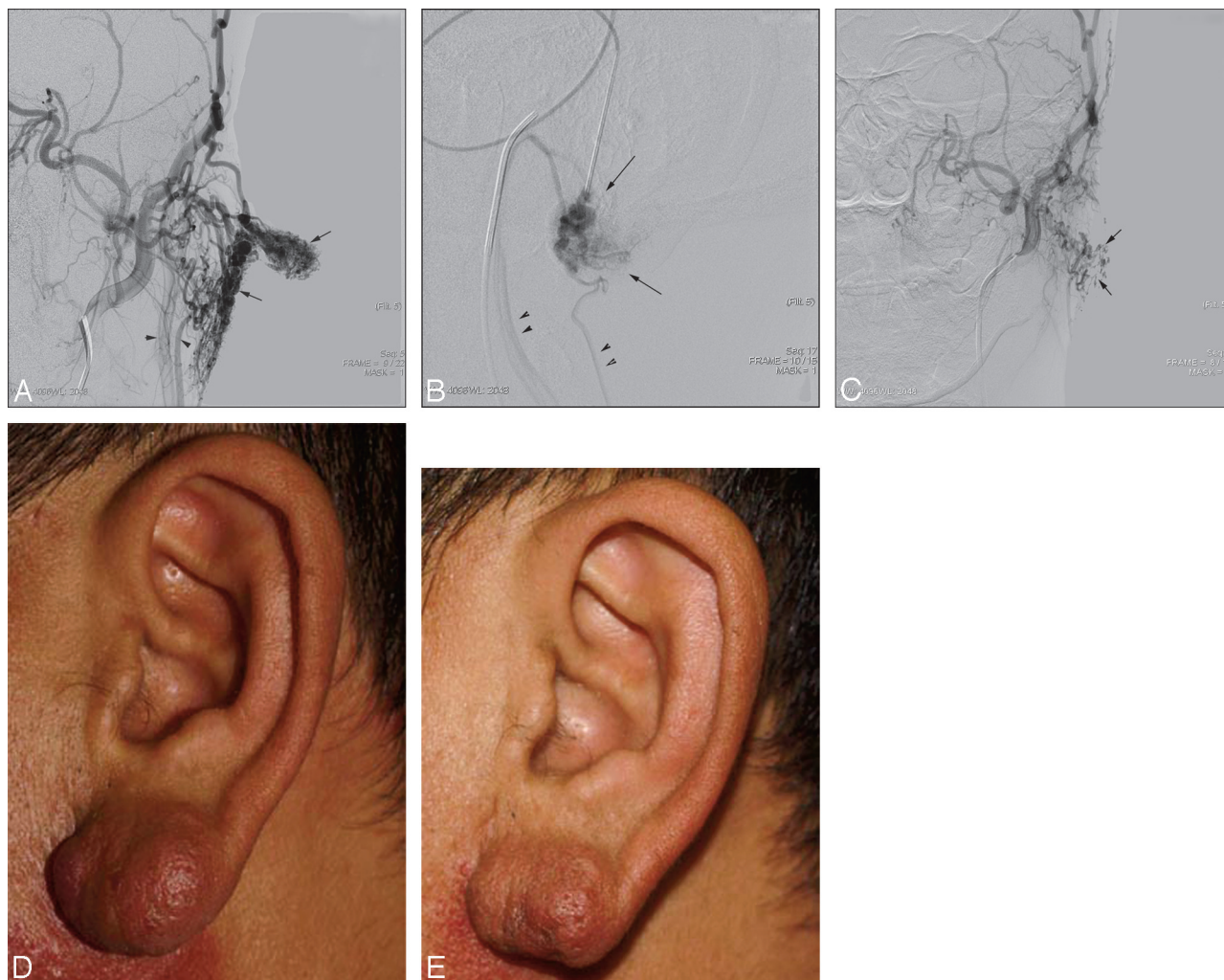
Fig 2. Patient 6, who presented with AVMs at the left ear lobule and contiguous cheek. A , AP arteriogram image obtained before embolization shows vascular nidus ( arrows ) around the left ear lobule and contiguous cheek, and a dilated outflow vein ( arrowheads ). B , Lateral DSA image obtained after direct percutaneous puncture but before embolization demonstrates filling of vascular nidus ( arrows ) and draining veins ( arrowheads ). There was 16 mL of 66% ethanol embolization that was performed at this point. C , Late-phase AP image obtained 7 months after the ethanol embolization shows obliteration of the AVMs around the lobule and persistent vascular hyperemia around the cheek ( arrows ); however, no arteriovenous shunt or draining veins are present. D , The lateral view of the left ear before treatment shows swelling and redness of the left ear lobule. E , The lateral view of the left ear 7 months later after treatment shows shrinkage of the swelling and darkening of redness of the left ear lobule.