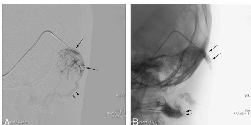
Fig 3. Patient 3, a 30-year-old man with left auricular AVMs causing ulceration and bleeding. The patient had a history of ligation of the left external carotid artery and deterioration of the lesion. Direct puncture embolization was performed to treat the AVMs, and necrosis occurred. A , Lateral DSA image obtained after direct percutaneous puncture demonstrates filling of vascular nidus ( arrows ) and draining veins ( arrowheads ). There was 5 mL of absolute ethanol that was injected at this point. B , The fluoroscopy image on the retrospective study revealed a fine residual stain of former injected contrast medium ( long arrows ) in the tissue of the superior helix under fluoroscopy performed 13 s after the angiogram showed above. The obvious residual stain of contrast in the lobule ( short arrows ) is found, ethanol injection is terminated, and no necrosis developed in the lobule.