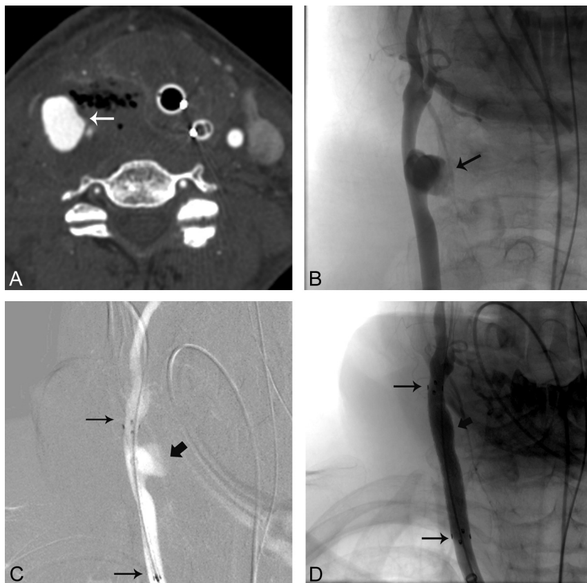
Fig 1. A 51-year-old woman with glottic and hypopharyngeal cancer who presented with hemoptysis (On-line Table). A, Axial contrast-enhanced CT scan of the neck shows extravasation from the RCCA (arrow) with surrounding air. B, AP RCCA angiogram shows the area of extravasation (arrow). C, AP roadmap of the RCCA shows placement of a covered stent (long arrows) across the area of extravasation (short arrow). D, AP RCCA angiogram after covered stent (long arrows) placement shows no evidence of extravasation (short arrow).

similar to those of the initial CBS presentations (On-line Table).