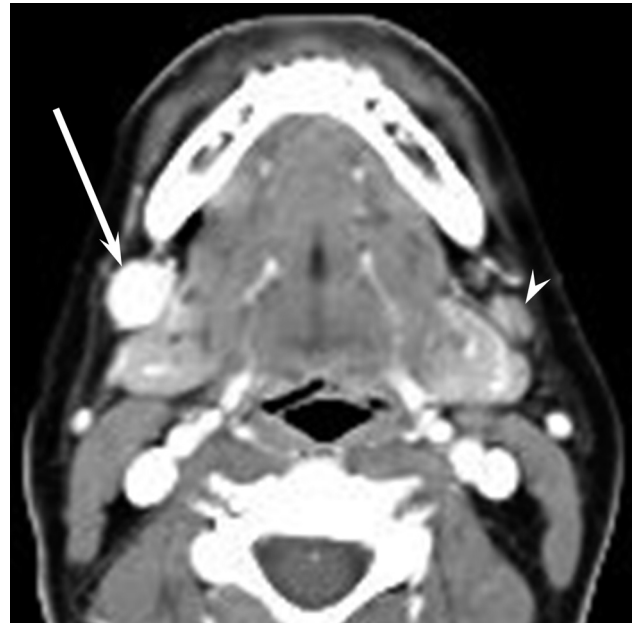
Fig 1. Contrast-enhanced axial CT image from a PET/CT examination demonstrating EMB metastasis (arrow) in a right zone IB lymph node. The metastatic lymph node demonstrates maximal contrast enhancement, similar in attenuation to arteries. A normal contralateral lymph node is indicated (arrowhead) for comparison.

On CT, metastatic lymph nodes were predominantly to completely solid in appearance (Table 3). In only 1 patient was a predominantly cystic metastatic node seen on CT. Addition-