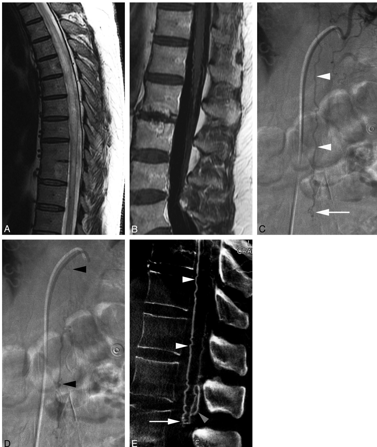
Fig 2. 57-year-old man with a perimedullary arteriovenous fistula of the conus medullaris. A , MR imaging, sagittal T2-weighted image of the thoracic spine, showing diffuse spinal cord swelling and hyperintensity; B , MR imaging, sagittal T1-weighted image after gadolinium administration of the lumbar spine. Note the presence of enhancing venous structures around the conus medullaris and along the filum terminale. C , Spinal DSA, left T10 injection, anteroposterior view, early arterial phase, showing a prominent descending ramus of the anterior spinal artery ( white arrowheads ) reaching the level of the conus medullaris, where a small tangle of blood vessels may be seen ( arrow ). D , Spinal DSA, left T10 injection, anteroposterior view. In the late arterial phase, while the vascular tangle is still visible, extensive opacification of the perimedullary venous system is noted ( black arrowheads ). E , FPCA, left T10 injection, sagittal MIP, voxel size = 0.4, section thickness = 3.0, demonstrating the anterior spinal artery ( white arrowheads ) ending at the tip of the conus medullaris (L1/L2) into a Type I perimedullary arteriovenous fistula ( arrow ). The posterior location of the enlarged draining veins detected by spinal DSA is well documented on this sagittal reconstruction ( gray arrowhead ).

titular, the exact location of the shunt and abnormal perimedullary veins detected by spinal DSA, later confirmed during surgical treatment (Fig 2E). High-resolution multiplanar re-