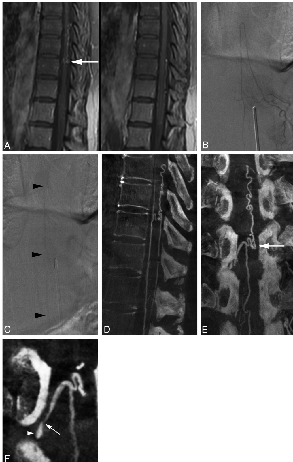
Fig 3. 58-year-old woman with a history of severe midscapular pain. A , MR imaging, sagittal T1-weighted images after gadolinium administration, showing prominent venous structures along the dorsal surface of the spinal cord between T8 and T12. A tangle of veins at the upper aspect of T10 was considered particularly suspicious for a vascular malformation ( arrow ). B , Spinal DSA, left T11 injection, anteroposterior view centered at T10/T11, arterial phase, documenting the artery of the lumbosacral enlargement (artery of Adamkiewicz). C , Spinal DSA, left T11 injection, anteroposterior view centered at T10/T11, venous phase. In this venous phase, the anterior spinal axis can be seen ( arrowheads ), without evidence of enlarged or abnormal veins. D , FPCA, left T11 injection, sagittal MIP, voxel size = 0.4, section thickness = 3.0, demonstrating the thoracolumbar perimedullary venous system, including the dorsal venous structures documented by MR imaging. E , FPCA, left T11 injection, coronal MIP, voxel size = 0.4, section thickness = 2.0. This coronal projection is an enlarged but otherwise unremarkable venous segment ending in a tangle of veins at the upper aspect of T10 ( arrow ), matching the suspicious structure seen by MR imaging ( A , left). F , FPCA, left T10 injection, oblique MIP, voxel size = 0.1, section thickness = 1.0. This high-resolution reconstruction depicts the fine morphology of the right medullary vein exiting the dural sac at T10/T11. Note the narrowing of the vein as it pierces the dura ( arrow ) to join the internal vertebral venous plexus (epidural plexus; arrowhead ).