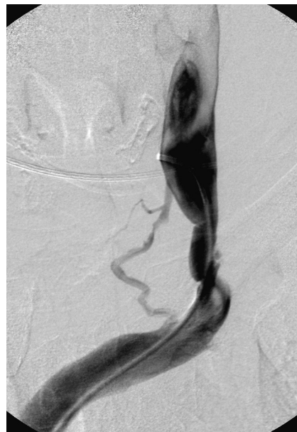
FIG 4. Anteroposterior venogram of the left IJV in a 50-year-old woman without MS being investigated for hyperparathyroidism. The moderate-sized collateral to the left brachycephalic vein is remarkably similar to that in Zamboni et al (Fig 4C). 12

similar to the rate of IJV narrowing of \geq 50\% in our small series of 8/9 patients (88.9%) without MS.