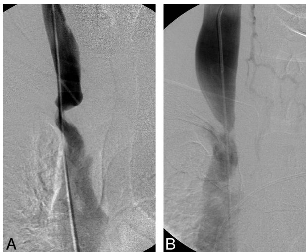
FIG 3. Selective anteroposterior venography of the right IJV. A, A 60-year-old female patient without MS being investigated for hyperparathyroidism. B, A 51-year-old man without MS being investigated for Cushing disease with petrosal sinus sampling. Both images demonstrate very high-grade narrowing of the distal IJV. Figure 3A is remarkably similar to Fig 2 in Ludyga et al, 45 and 3B is very similar to Fig 2B (e and f) from Zamboni et al, 9 Fig 2 from Simka et al 40 and Fig 4A from Zamboni et al. 12

Simka et al 40 published a large series on venography in 586 patients with MS demonstrating venous abnormalities in 64% of the right IJVs and 81.7% of the left IJVs. Stenosis of the IJV was demonstrated unilaterally or bilaterally in 59 of 65 patients with MS (91%) in the study of Zamboni et al, 12 which is remarkably