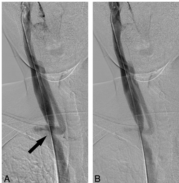
FIG 2. Selective anteroposterior venography of the right IJV demonstrates a high-grade narrowing of the distal IJV (black arrow) with an associated large collateral vein. This patient is a 44-year-old woman without MS who was being investigated for hyperparathyroidism. These appearances are remarkably similar to those in Zamboni et al (Fig 5) 12 ; Zamboni et al (Fig 2Bg) 9 ; and Simka et al (Fig 3) 40 .

diagnosis of chronic cerebrospinal venous insufficiency should, therefore, rest with venography.