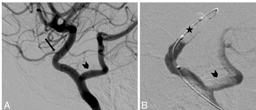
FIG 1. A, Left internal carotid artery run showing ophthalmic artery takeoff at an acute angle ( arrow ) and a type 1 persistent trigeminal artery ( arrowhead ). B, Left internal carotid artery microcatheter run after inflation of a hypercompliant balloon within its lumen distal to the origin of ophthalmic artery ( star ), showing no opacification of the ophthalmic artery and preferential flow across the persistent trigeminal artery ( arrowhead ).