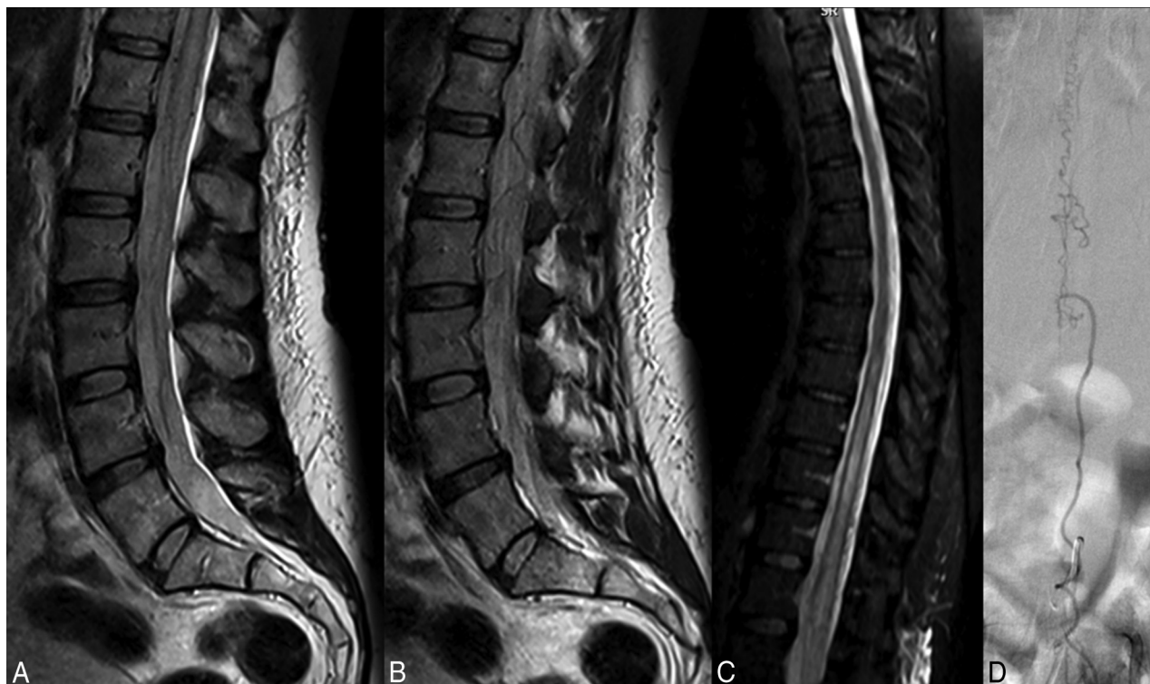
FIG 1. A 57-year-old woman with a 3-month history of bilateral lower extremity tingling and progressive lower extremity weakness. A and B , T2-weighted lumbar spine MR images demonstrate high T2 signal in the conus with multiple flow voids in the intradural space. C , T2-weighted MR image of the thoracic spine demonstrates high T2 signal in the lower thoracic cord to the conus. The patient was diagnosed with neuromyelitis optica and received no spinal-vasculature imaging before referral to our institution. Two rounds of IV methylprednisolone (Solu-Medrol) therapy resulted in worsening of symptoms, and rituximab therapy was of no benefit. D , Spinal angiography demonstrates the spinal dural AVF with an arterial feeder from the L3 radiculomeningeal artery.