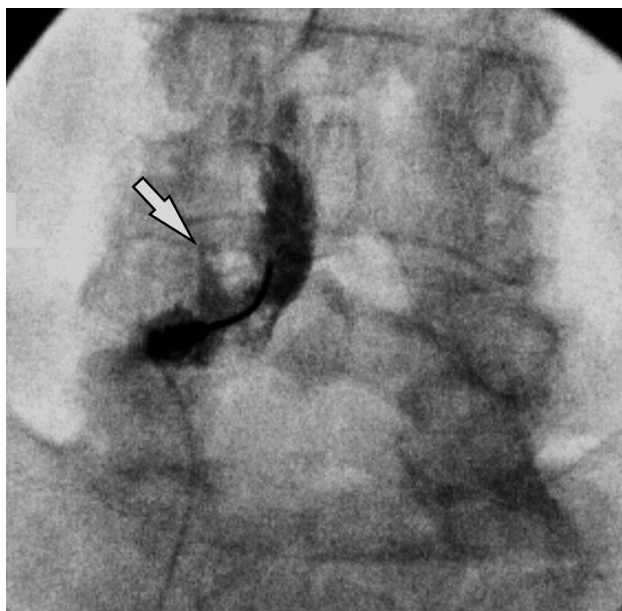
FIG 3. Inadvertent intrafacet injection in a 63-year-old man with a painful L4–5 central disc protrusion who underwent ILESi by using conventional fluoroscopic guidance. The final procedural image shows a triangular configuration of contrast overlying the inferior aspect of the left L4–5 facet joint, consistent with intrafacet injection.