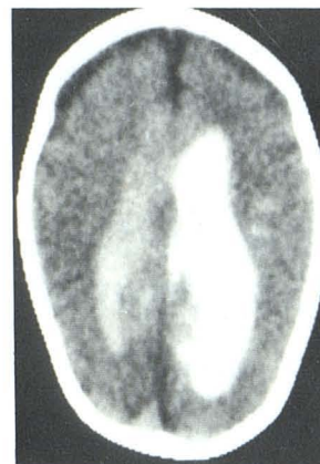
Fig. 2.—Case 4. CT cisternogram 3 hr after lumbar intrathecal injection of 4 ml metrizamide (150 mg iodine/ml). CT attenuation value in left lateral ventricle, 118 H; in right lateral ventricle, 38 H. Ventricular reflux predominantly unilateral. (H = Hounsfield units.)

findings, are indications for a shunt installation [12]. If there is no stasis, a shunt operation is not necessary. But the occurrence of totally or predominantly unilateral reflux with stasis requires insertion of an intraventricular shunt catheter in the affected ventricle.