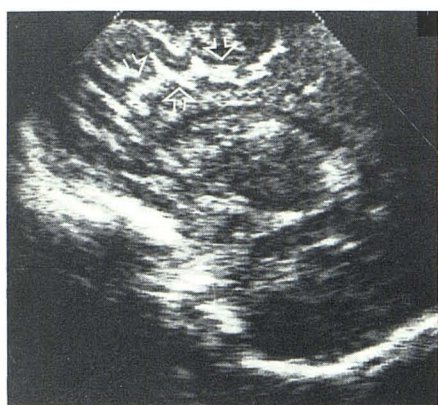
Fig. 1.—Left sagittal section showing bright convolitional markings (arrows).

Note.—None of these complications followed meningitis caused by group B Streptococcus (n = 1) or nonenterococcal group D Streptococcus (n = 1).