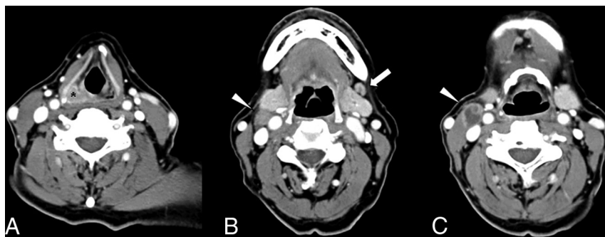
FIG 1. Example of lymph node scoring. CT images show a 71-year-old man with right hypopharyngeal cancer (asterisk, A) in the lymph node at left cervical level 1 (arrow) and right cervical level 2 (arrowhead). Zero points for left cervical level 1 suggest benign lymph nodes (B), whereas 5 points for right cervical level 2 lymph node are calculated following the scoring system (0 points for stage 2 [T-stage], 1 point for 1.5 cm of shortest axial diameter, 1 point for 1.25 of long-to-short ratio, and 3 points for the cystic necrosis, C). The left cervical level 1 lymph node was classified as a benign lymph node, and the surgical specimen confirmed it as a benign lymph node. The lymph node in the right cervical level 2 was classified as high risk for the metastasis, and the surgical specimen proved it as a metastatic lymph node.

a Estimated metastases for the each score in the risk groups were as follows: low-risk group (score zero, 7% and score one, 17 %), intermediate-risk group (score two, 35%; score three, 58%; and score four, 78%), and high-risk group (score five, 90%; score six, 96%; score seven, 98%; score eight, 99%; and score nine, 100%).