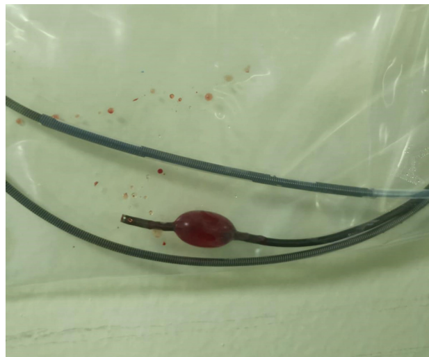
FIG 2. The damaged distal segment of the JET 7 thrombectomy catheter used in patient 2 has ballooned on flushing.

In this report, we have described 2 instances of unforeseen damage to the JET 7 reperfusion catheter encountered during