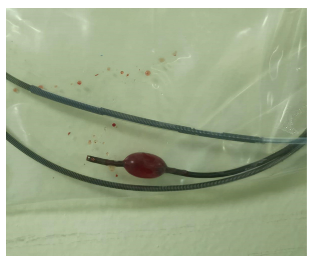
FIG 2. The damaged distal segment of the JET 7 thrombectomy catheter used in patient 2 has ballooned on flushing.

In this report, we have described 2 instances of unforeseen damage to the JET 7 reperfusion catheter encountered during