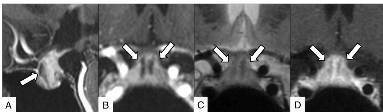
FIG 3. A 40-year-old woman receiving nivolumab plus ipilimumab for stage IV melanoma with corticotropin deficiency, hypothyroidism, and hand edema for 10 days. Contrast-enhanced 3D-MR imaging (90 seconds after contrast medium injection) demonstrates an enlarged pituitary gland and stalk and bilateral linear hypoenhancing lesions (A, sagittal reconstruction; B, coronal reconstruction, arrows). These lesions show hypointensity on the T2-weighted coronal image (C, arrows), and gradual enhancement is demonstrated in contrast-enhanced 2D coronal MR imaging performed 90 more seconds after the 3D MR imaging (D, arrows).