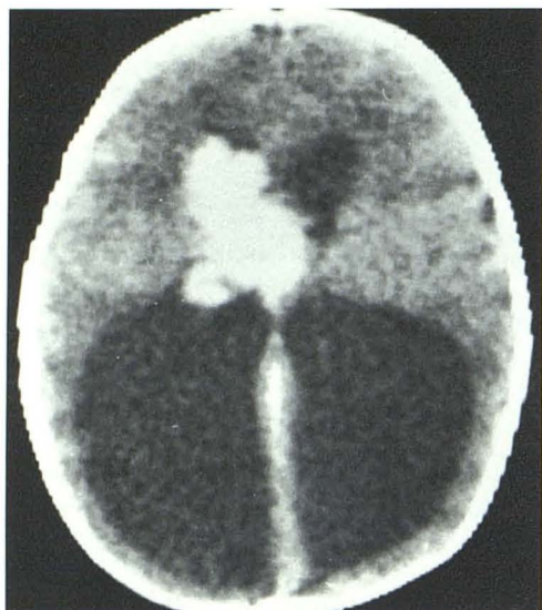
Fig. 3.—Preenhancement CT scan. Isodense lobulated intraventricular mass. After intravenous injection of contrast material, mass enhanced markedly and uniformly.

of the need of sedation, undesirability of ionizing radiation, and inconvenience and risks of patient transportation.