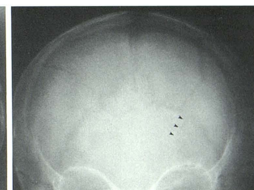
Fig. 2.—6-month-old abused girl. Multiple, bilateral skull fractures. Left parietal fracture crosses lambdoid suture (arrowheads).