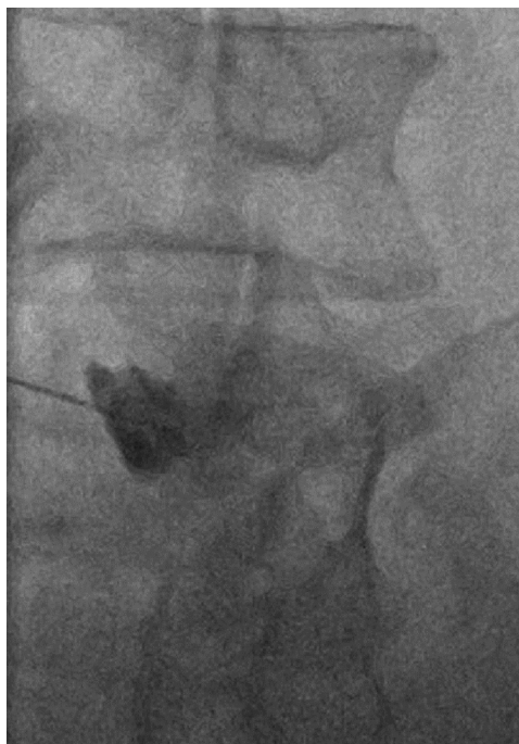
FIG 3. Oblique fluoroscopic image of the L4–L5 facet joint demonstrates a periarticular injection. Contrast pools around the needle tip adjacent to the hypertrophied facet joint. No contrast is identified within the joint or joint recess.

mL) of triamcinolone acetonide (Kenalog) ( n = 4 procedures). The injection was performed by either a musculoskeletal (MSK) fellow ( n = 30 ), an MSK faculty member ( n = 2 ), or an MSK fellow with an MSK faculty member present ( n = 68 ).