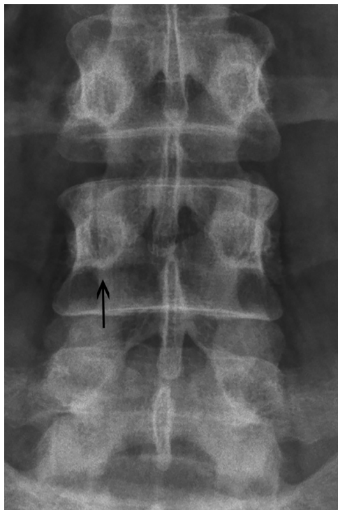
FIG 1. Anteroposterior image of the lumbar spine demonstrates the straight anteroposterior approach to accessing the inferior articular recess (arrow) of the facet joint.