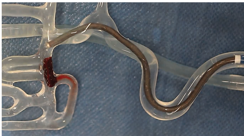
FIG 1. Flow model.

performed 10 training experiments before starting the study. The speed was calculated by dividing the time (measured by an assistant with a stopwatch) by the distance (measured from the guide catheter tip to the proximal limit of the thrombus with a flexible meter). The MT result was instantly graded by the performing physician according to an adapted TICI score: complete recanalization (TICI 3), recanalization with small emboli exceeding the model limits (TICI 2b), recanalization but emboli blocked distally (TICI 2a), a piece of thrombus removed but persistent occlusion (TICI 1), and no recanalization (TICI 0). Distal emboli