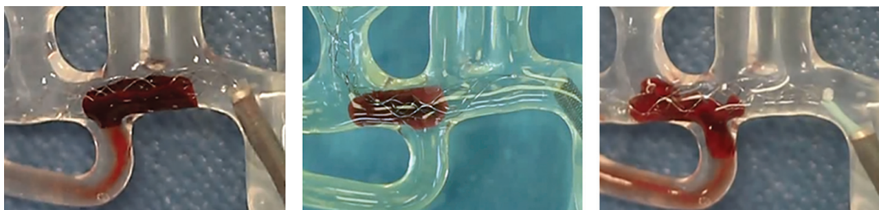
FIG 2. Clot types. The figure shows the 3 types of clot during MT inside the model: RBC-rich (left), fibrin-rich (middle), and hybrid friable clot (right).