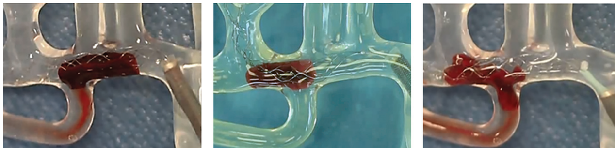
FIG 2. Clot types. The figure shows the 3 types of clot during MT inside the model: RBC-rich (left), fibrin-rich (middle), and hybrid friable clot (right).