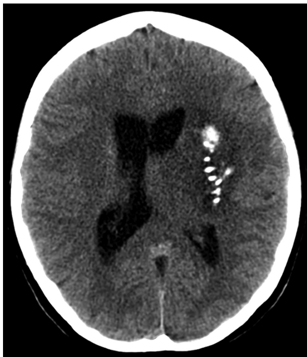
FIG 2. This unenhanced CT image demonstrates calcifications in an oligodendroglioma ( IDH^{mut} and 1p/19q codelet ) involving the left insula.

positive results in the presence of partial deletions. 3 In addition, sequencing can provide false-negative results if there are relatively few tumor cells within the sample, 4 particularly relevant to gliomas from which only a small sample can be safely obtained. The possibility of sampling error is also particularly relevant to intracranial diffuse gliomas, given their inherent heterogeneity. 5 This raises the likelihood that some tumors diagnosed as having 1p- or 19q-unideletion could actually be 1p/19q codeleted (1p/19q codelet ),